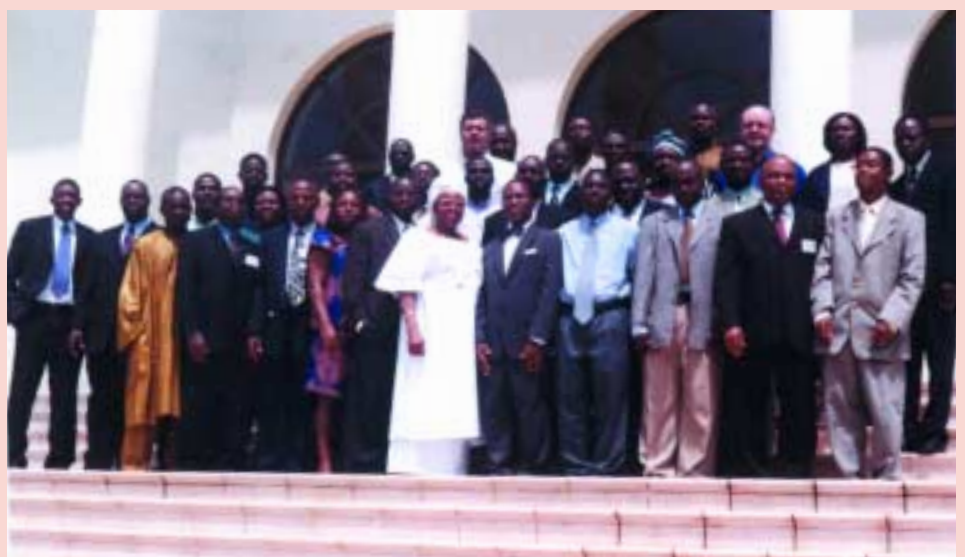
WAIFEM TTT, May 2003, Accra, Ghana

More generally, they recommended issuing manuals and templates to participants 2 weeks before the workshop to give keen participants a chance to prepare data and ideas; and ensuring the nomination of correct participants. They also requested more training in Debt-Pro© in a separate regional workshop.