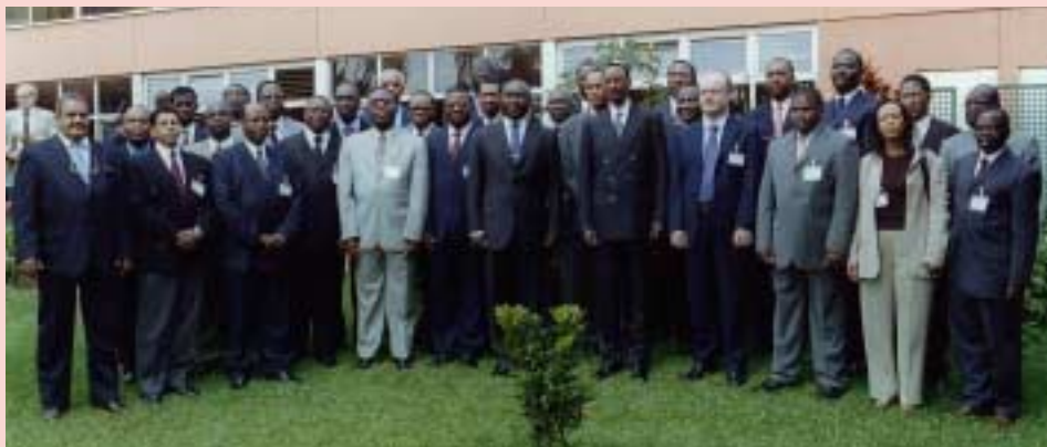
H. E. Paul Kagame, President of the Republic of Rwanda, opening the 8th HIPC Finance Ministers Meeting

In the Kigali Declaration, Ministers reiterated their appreciation for measures by the international community to implement HIPC II, to mobilise additional financing for development, to enable countries to implement poverty reduction strategies, and to enhance HIPC government capacity to manage development financing and poverty reduction programmes. They stressed once more their commitment to designing and implementing poverty reduction strategies, and to doing everything in their power to spend debt relief and new financing productively and transparently on poverty reduction. Nevertheless, they raised important common problems which require urgent attention if HIPC countries are to